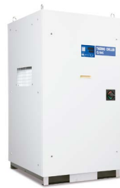
HRSF Series +