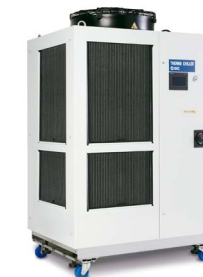
HRLF Series +