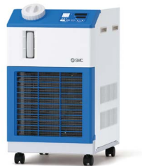
HRSC Series +