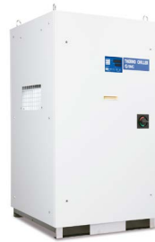
HRSF Series +